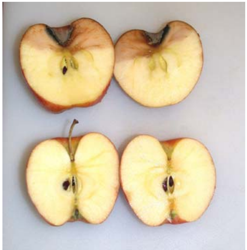
Figure 2: Apple Comparison on Day 11. The top apple is the control and the bottom, the experimental