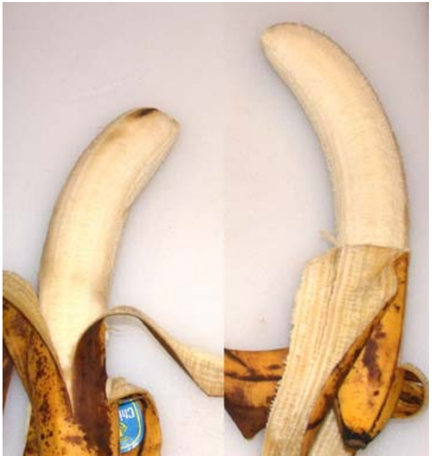
Figure 3: Bananas at Day 11. Control specimen located on the left and experiment on the right

More experimentation needs to be conducted. This experiment was a small-scale foray and large-scale, directly applicable experimentation needs to be done. However, this experiment demonstrates the ability of ozone to retard the ripening process and prolong certain produce’s saleable shelf life. These experiments were not directly practical. However, the next set of experiments will use a one time large dose.