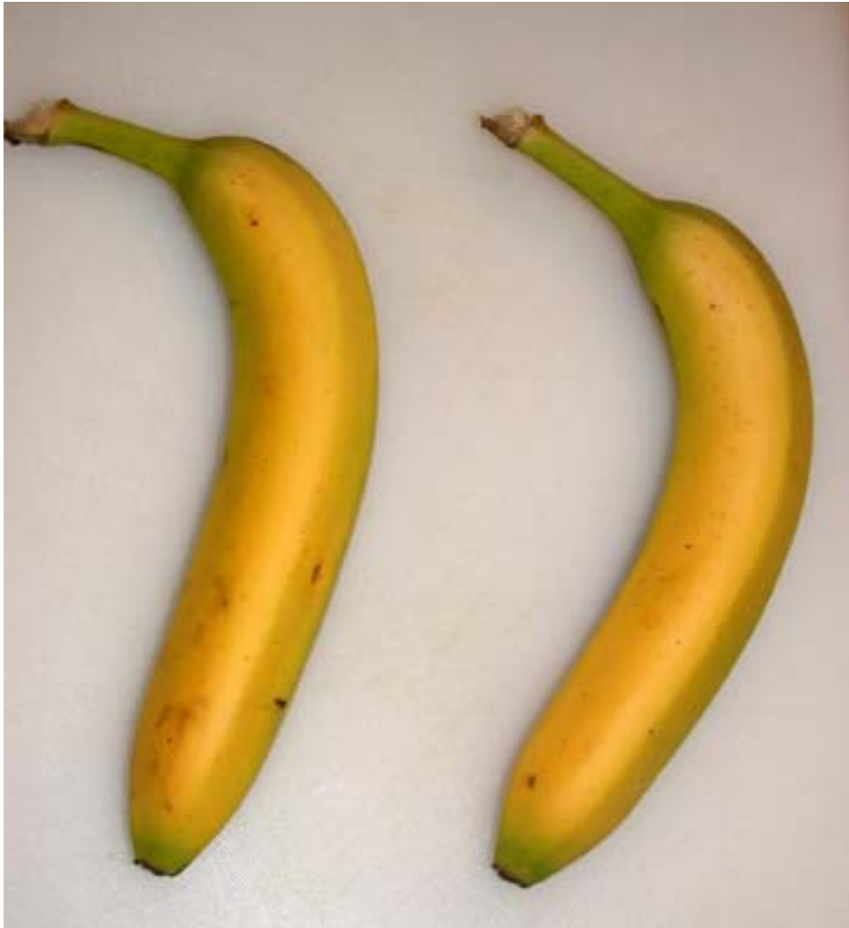
Figure 5: Control Banana on the left and Experimental on the right at Day 1