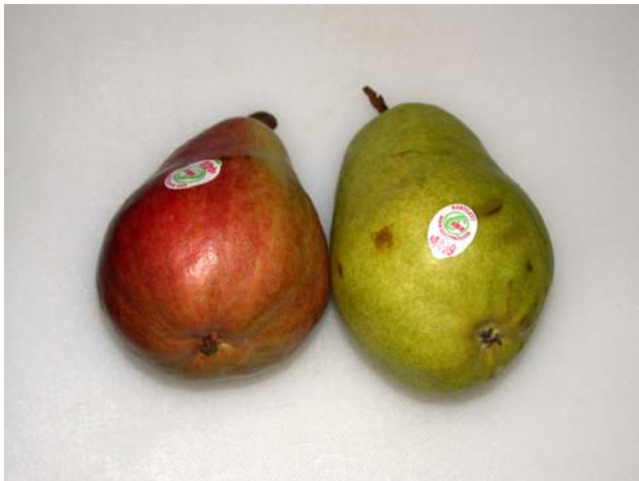
Figure 6: Control Pear on the Right, and Experimental on the left at Day 1