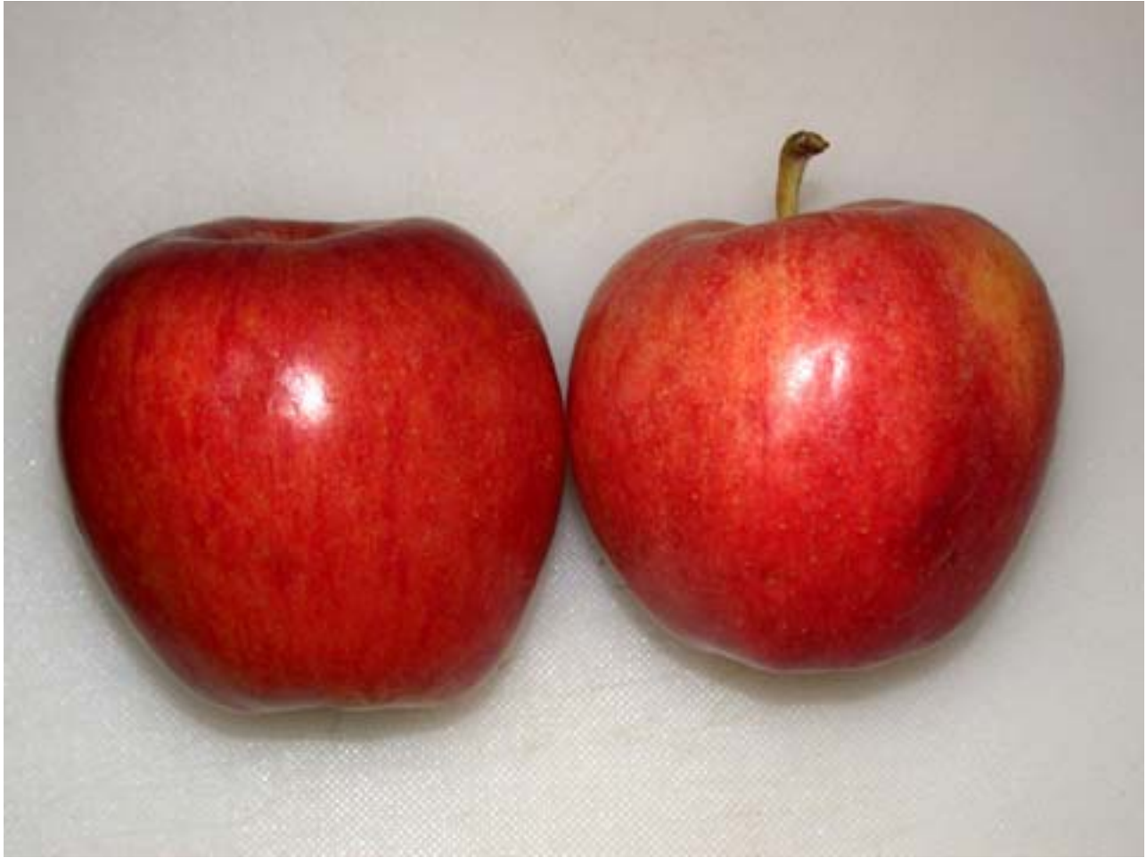
Figure 4: Apple Control on the Left and Experimental on the Right at Day 1