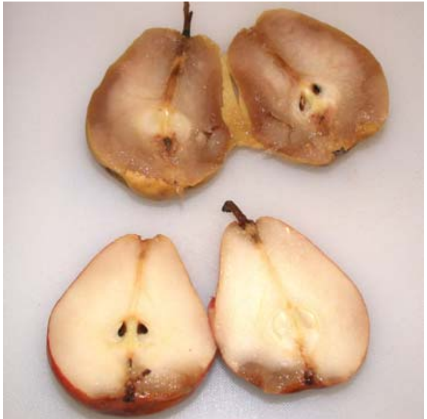
Figure 1: Pear comparison after 11 days. Lower pear is the experimental and upper pear is the control

The bananas were both part of the same bunch and kept in similar environments. Throughout the experiment the bananas developed brown spots on the peel similarly. These spots were not excessive nor were they telling of overly ripe bananas. On the eleventh day, the bananas appeared similar externally. However, the control banana was noticeably softer than the experimental. Upon internal examination it was easy to see the difference between the two, as is evident in Figure 3.